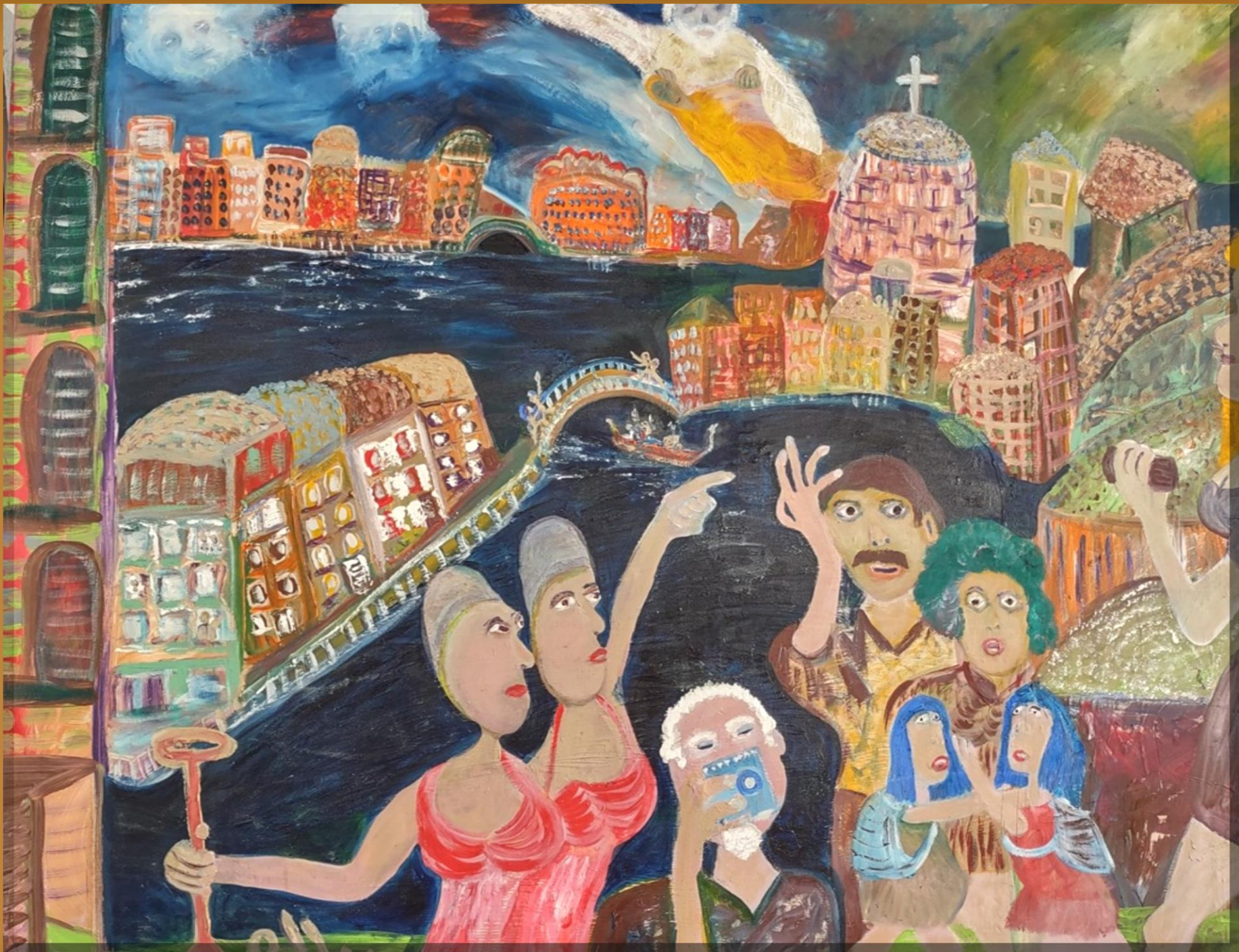
'DEATH IN VENICE'