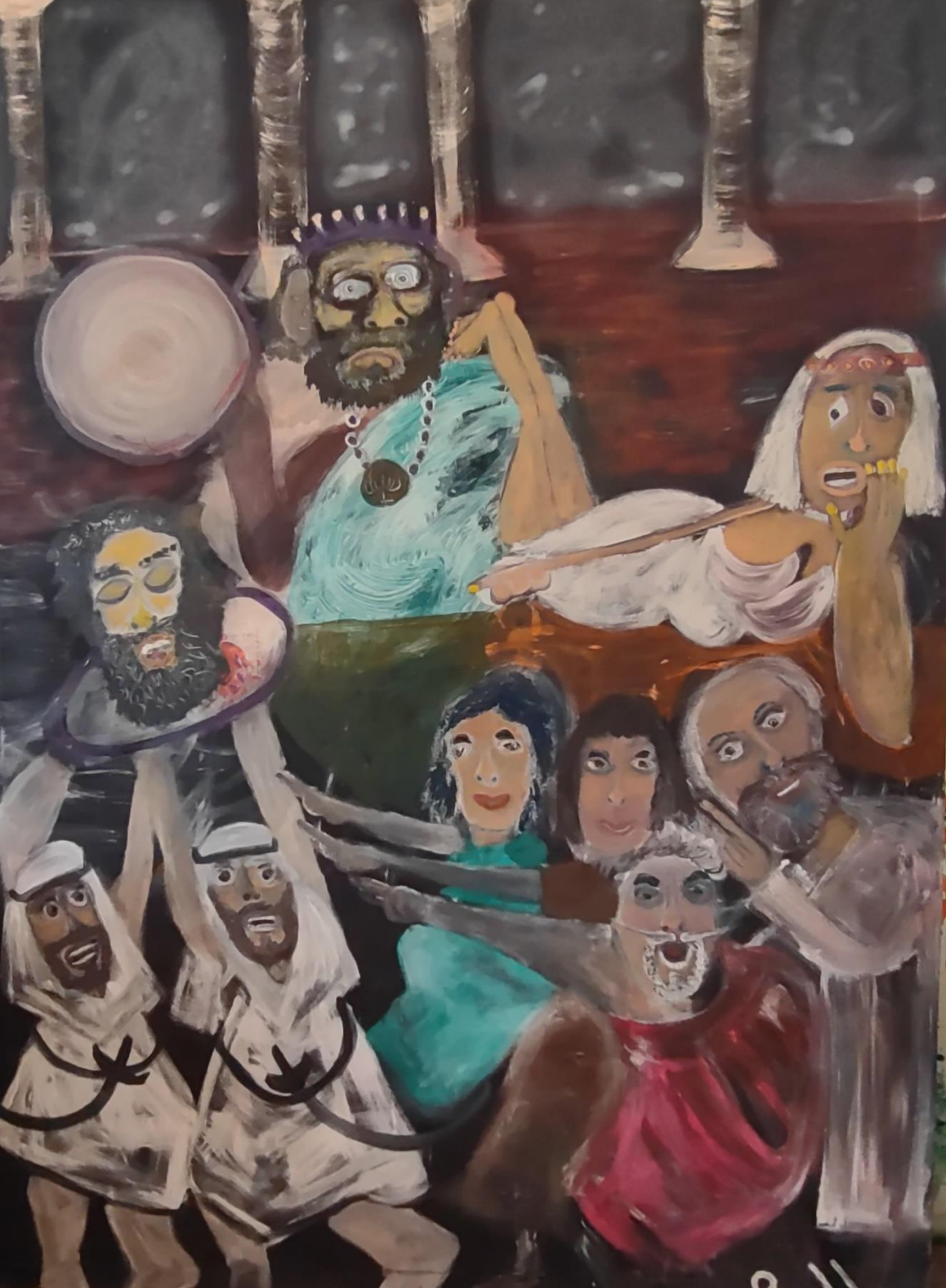
'HEAD OF John The Baptist' 2