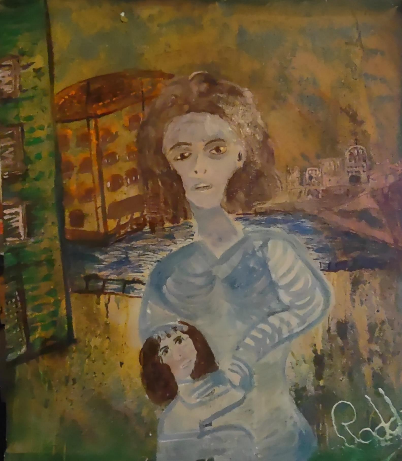
'Homeless woman and child near Venice Italy'