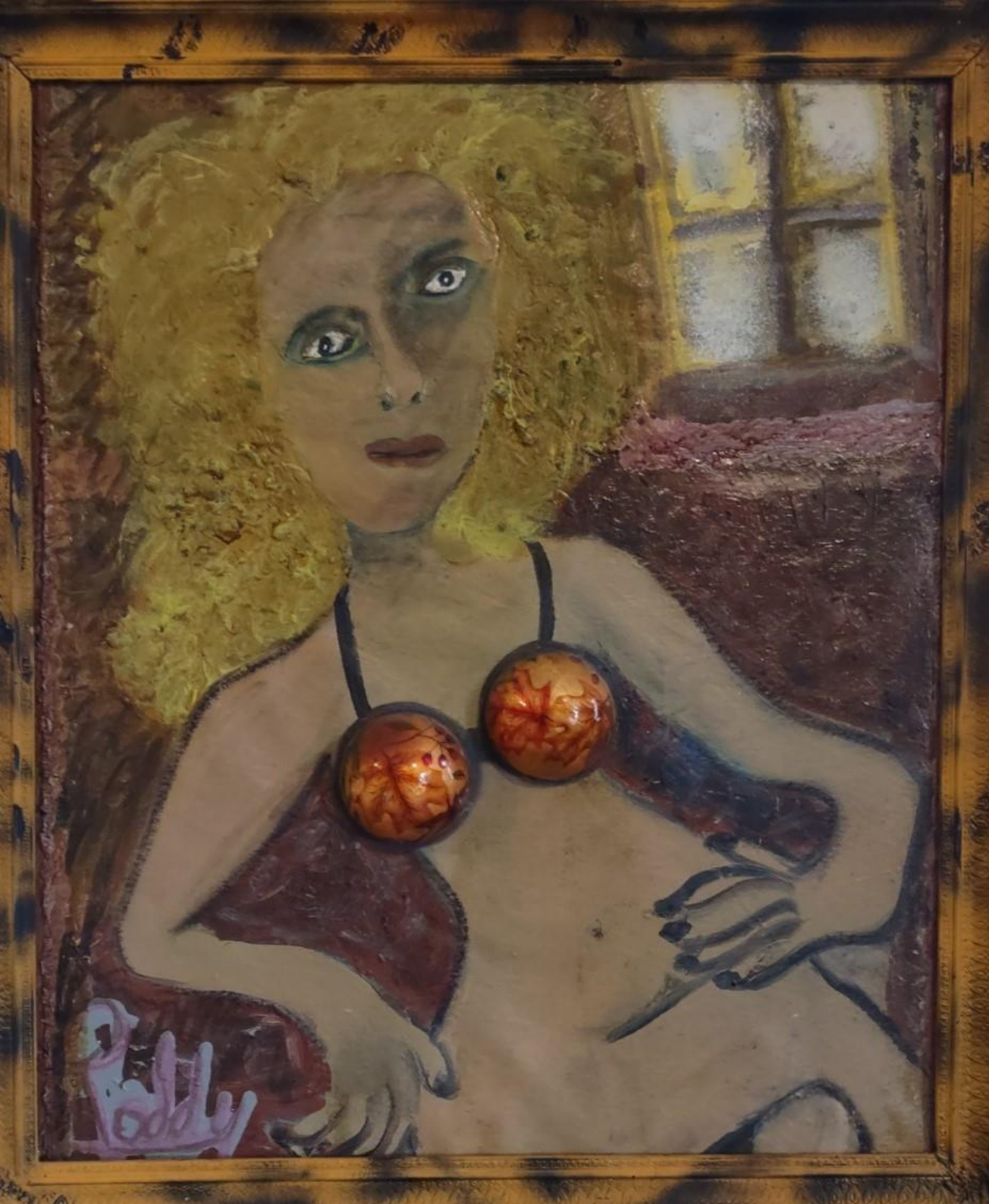
'Woman in Belgium'