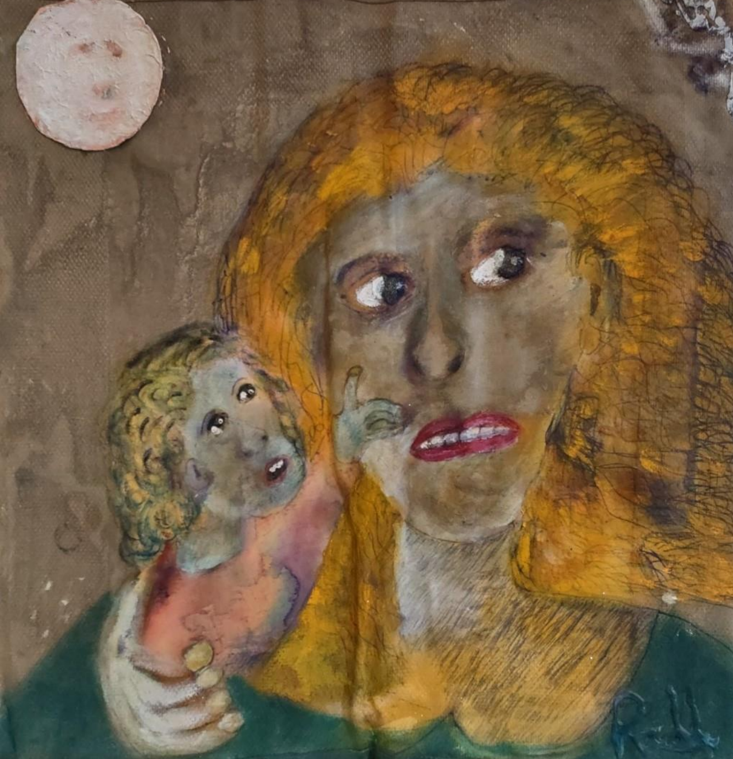
'Baby sees apparition'