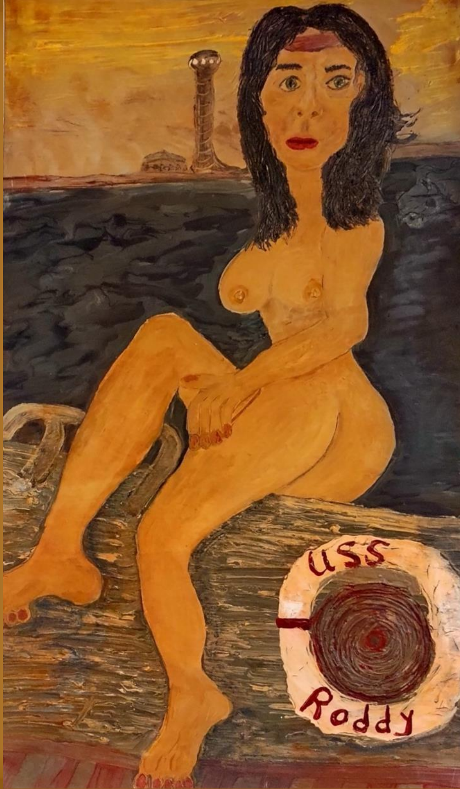
WOMAN ON RUDYS BOAT ON ITS WAY TO ARUBA