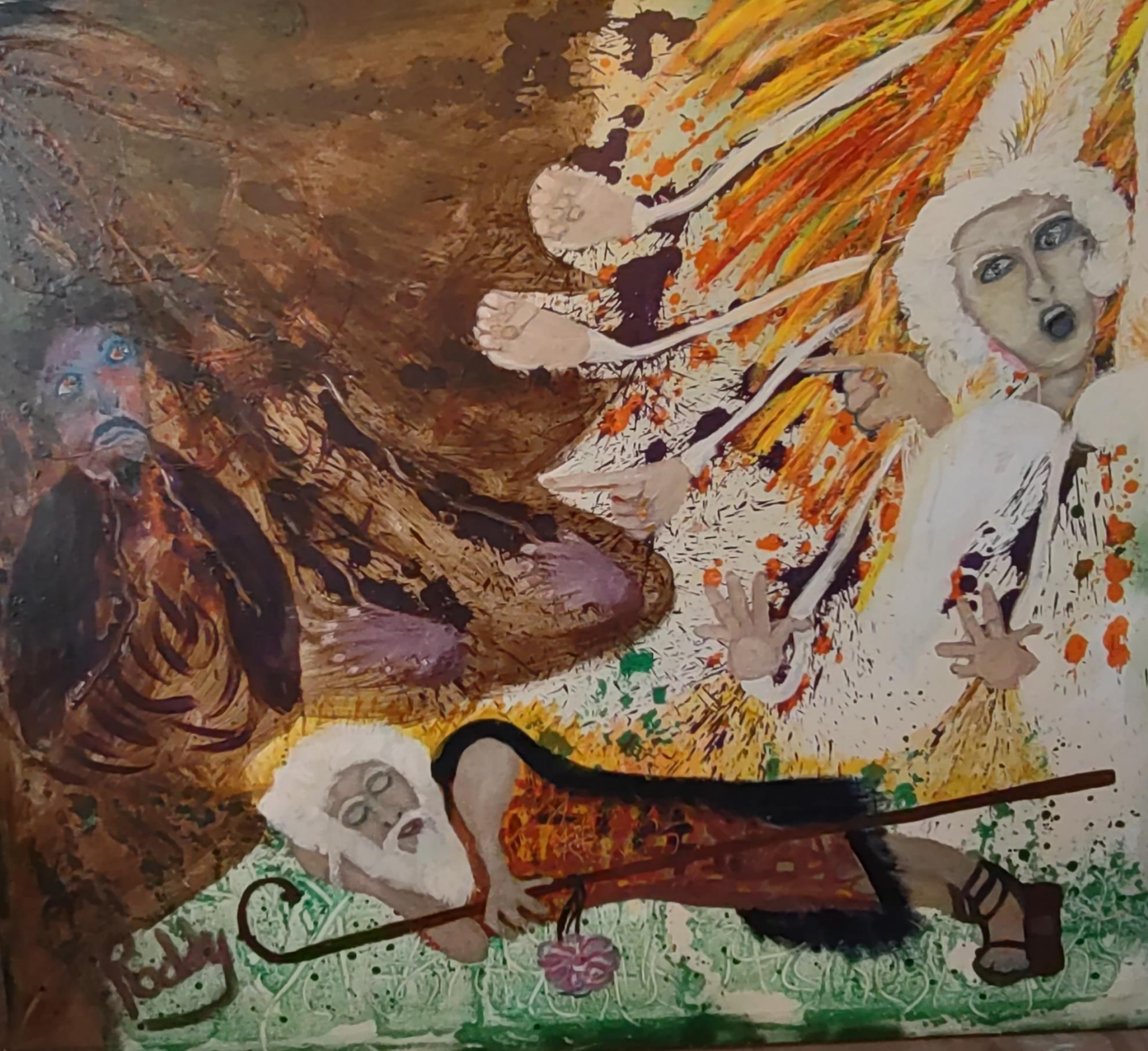
'Dispute the body of Moses' 2