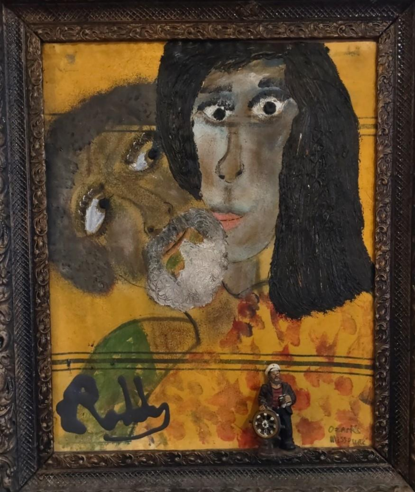
'Rudy and Friend 2015'