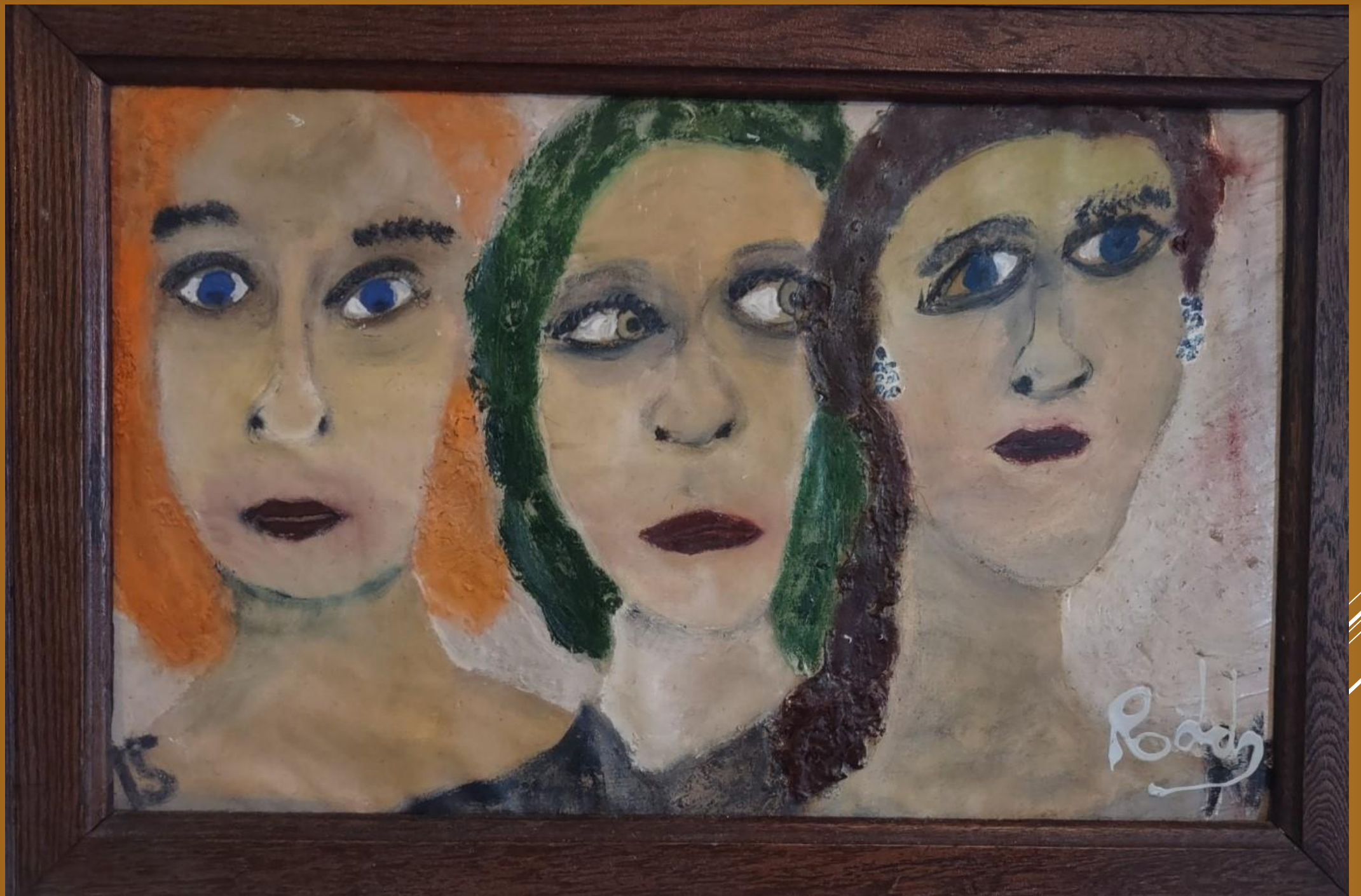
'Three sisters 2013'