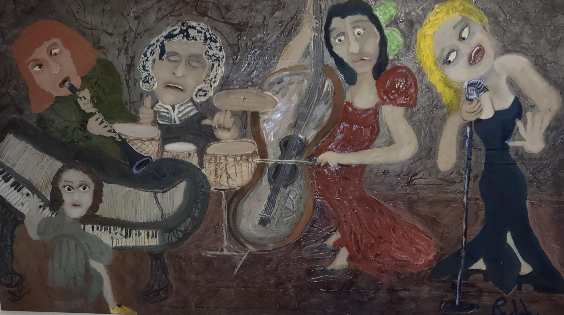
'1941 All Woman Swing Band'