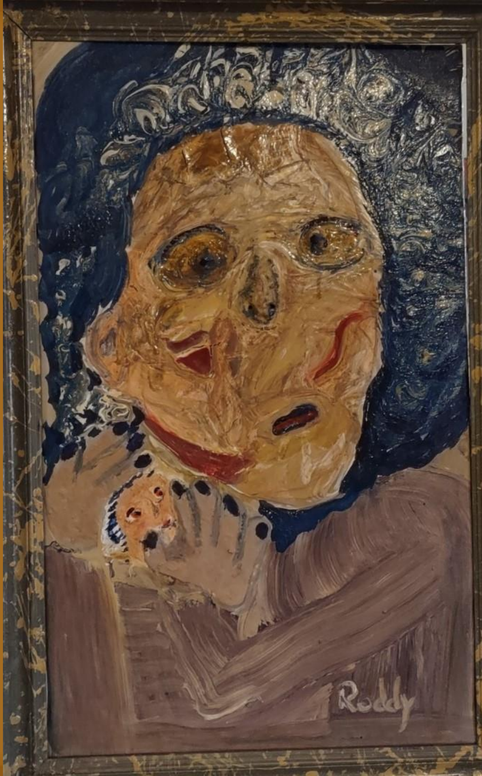
'Woman mared by fear'