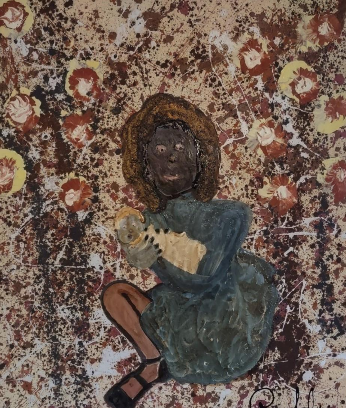
'Coal Miners Daughter and Granddaughter'