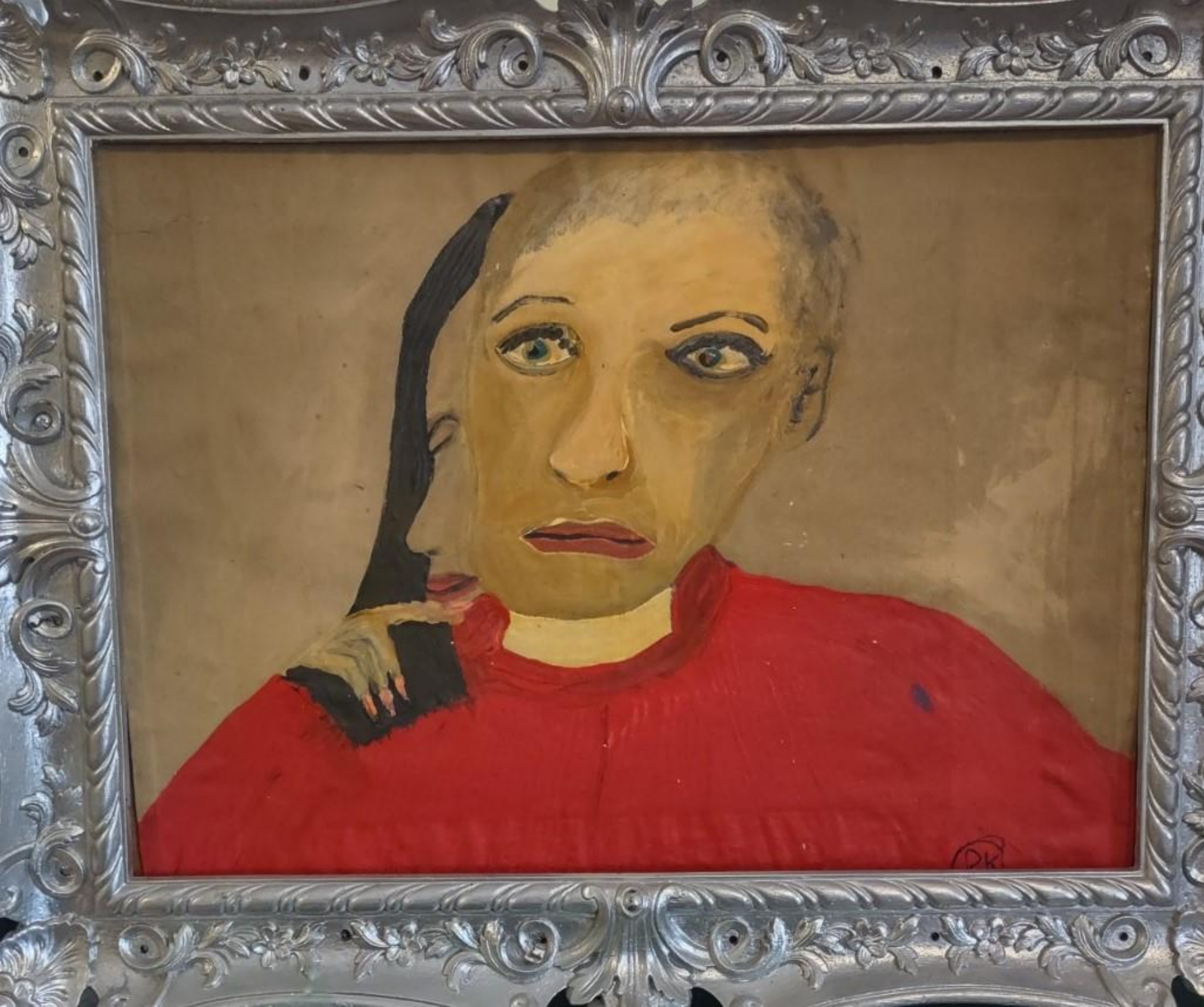
'The Bishops Wife'