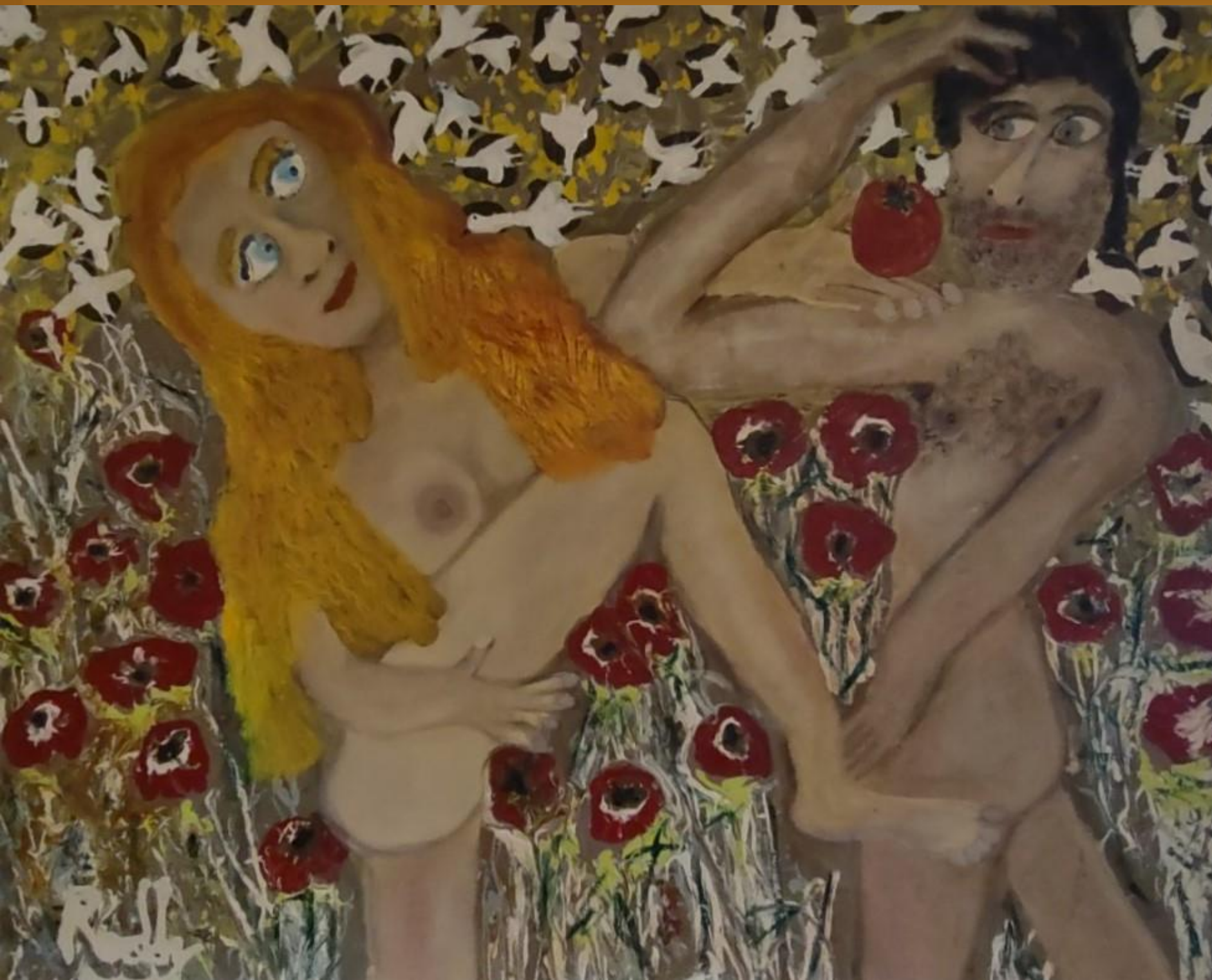
'Another Adam and Eve painting'