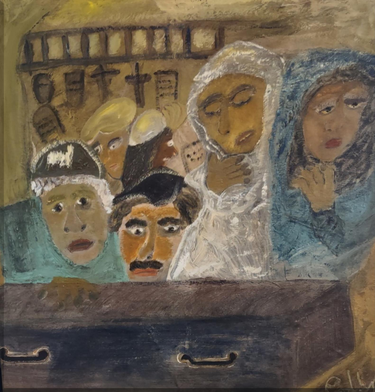
'Death of a child 2014- 2014 Syria'