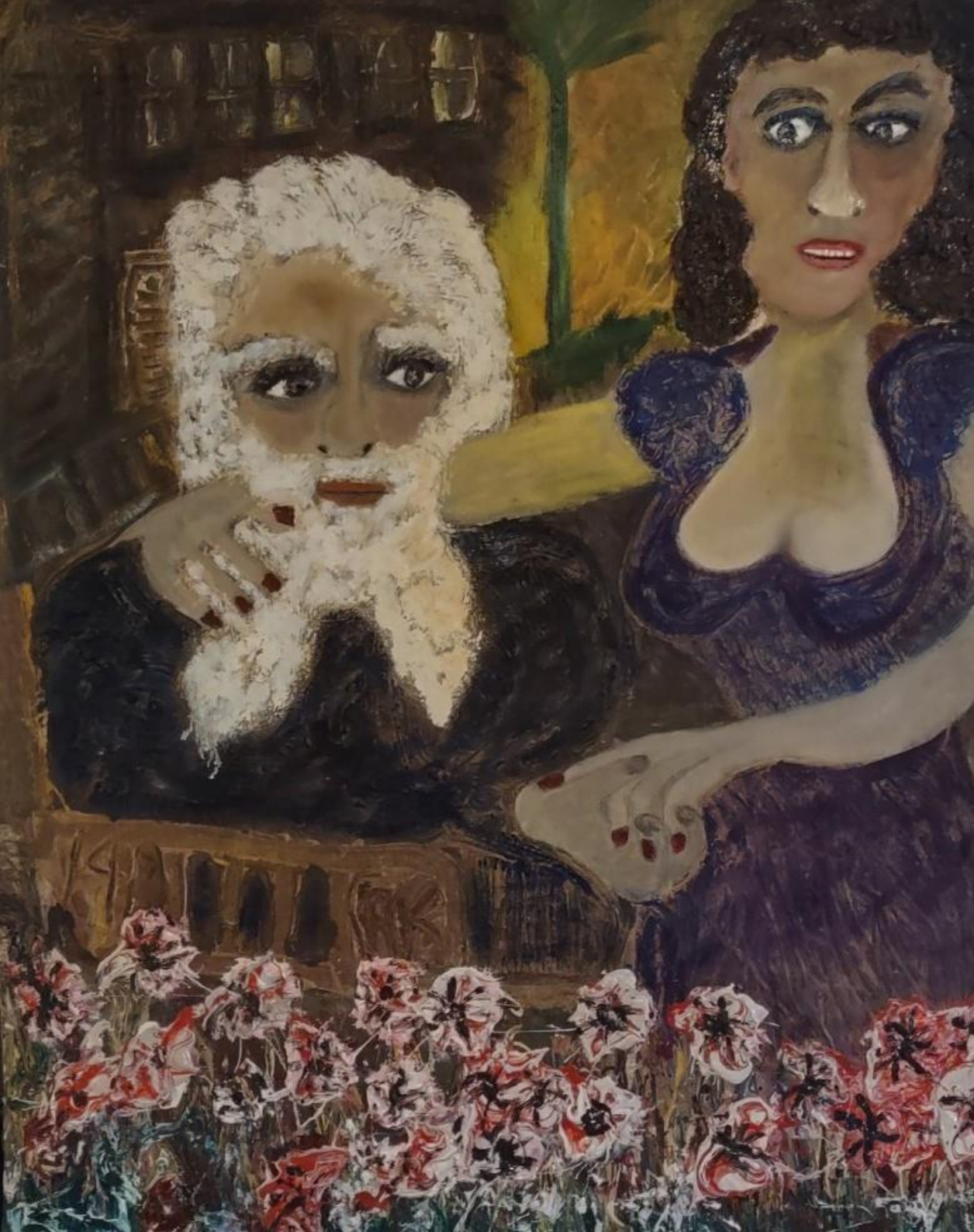
'Tostoy and his daughter'