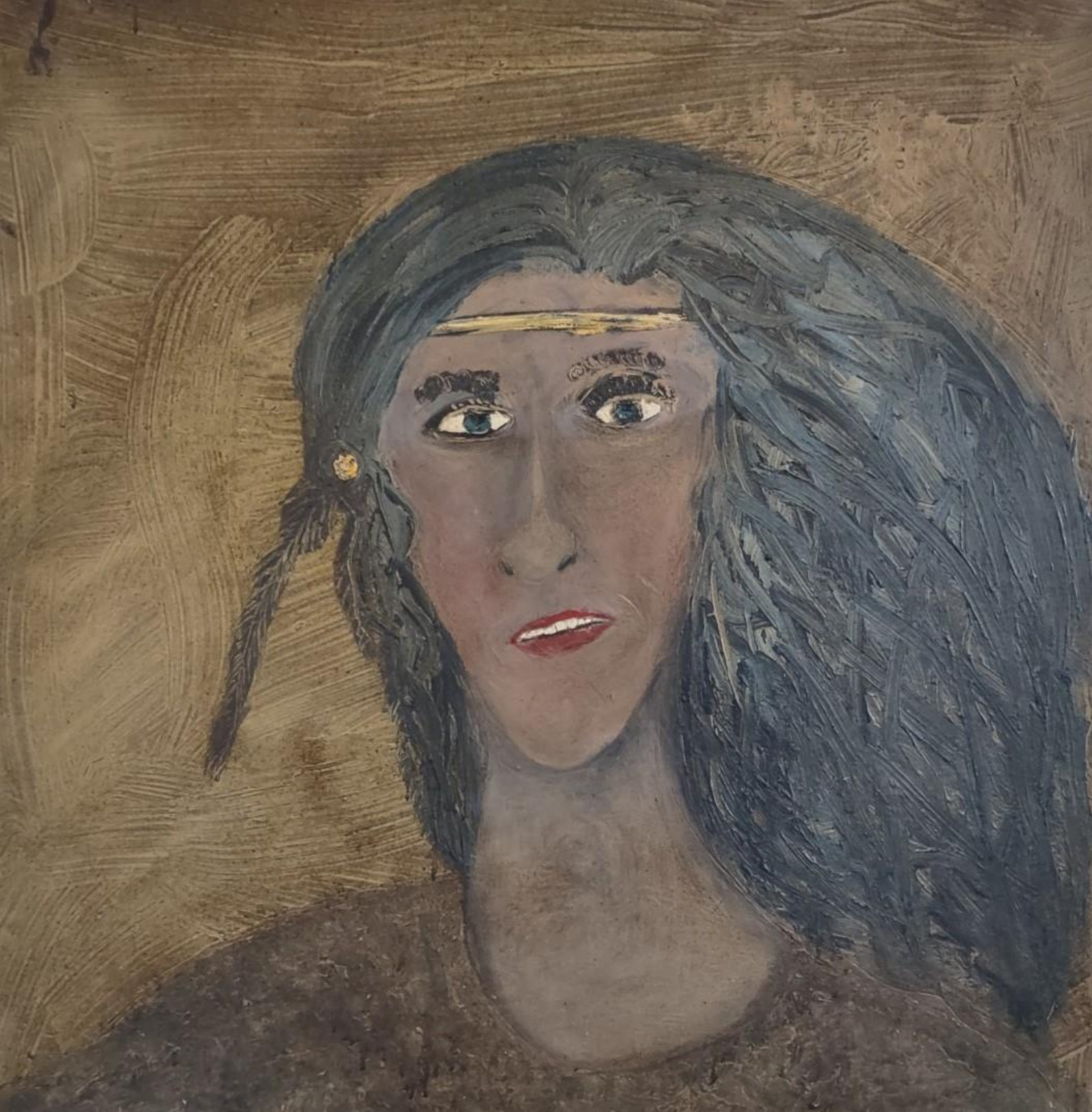
'Cherokee indian from Kokomo Indiana'